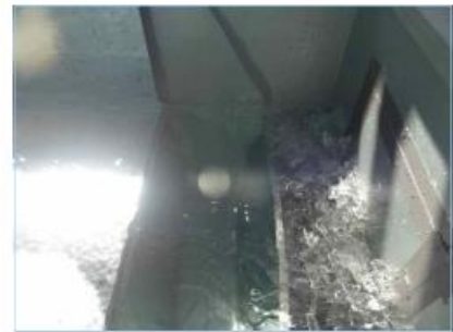
DB 500-1, Q = 16 l/s (box gutter slope - 1 in 200)